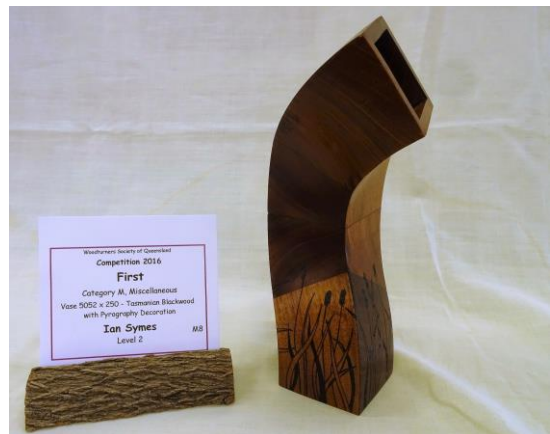
Tasmanian Blackwood Vase by Ian Symes